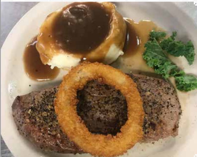
HERB SEASONED SIRLOIN

Our 10 oz. sirloin steak topped with a delicious, slow-melting house mason butter. A step up for steak! – 28.5