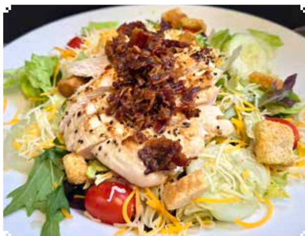
CHICKEN BLT SALAD