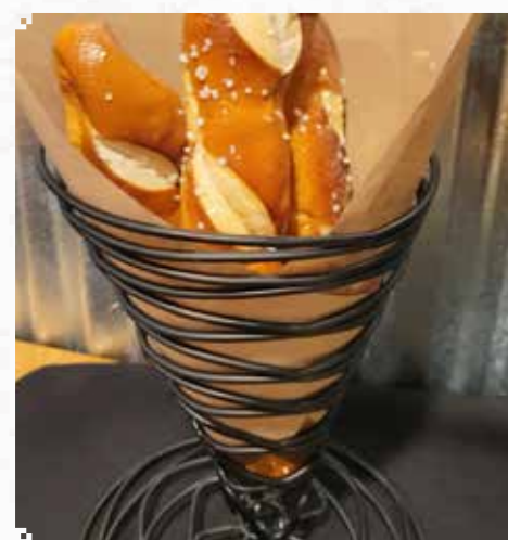
SOFT PRETZEL STICKS