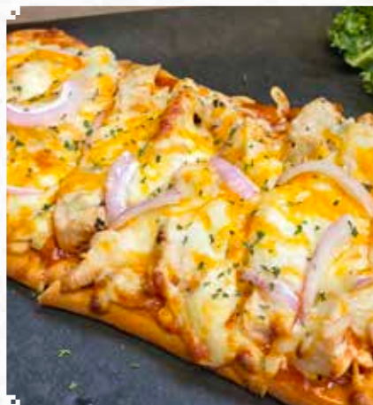
HOT GARLIC CHICKEN FLATBREAD