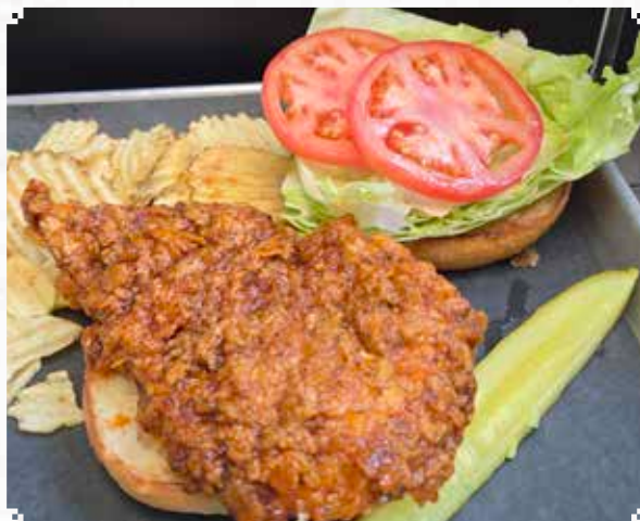
NASHVILLE HOT CHICKEN SANDWICH