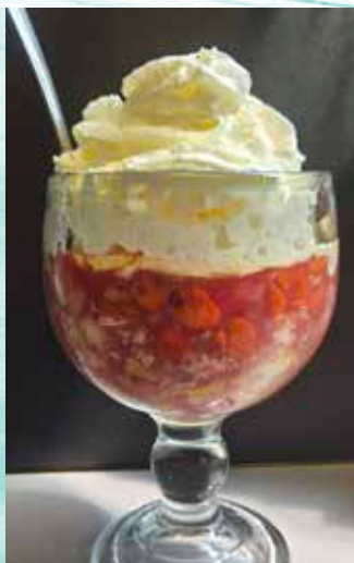
OLD FASHIONED CHERRY COBBLER