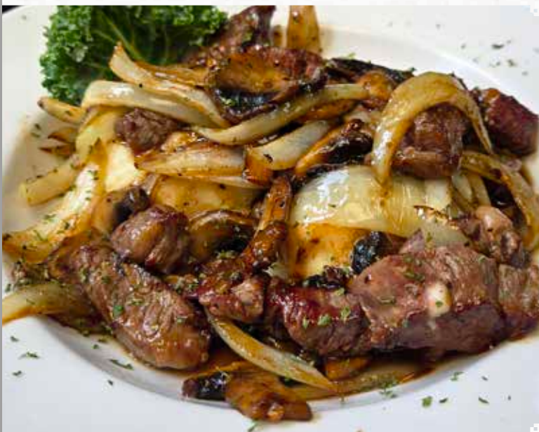
BOURBON STEAK BOWL