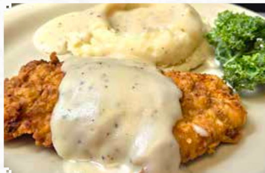
COUNTRY FRIED CHICKEN STEAK

Two chicken breasts smothered with grilled onions, mushrooms and provolone cheese – 18