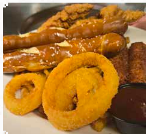
MEGA SAMPLER PLATTER