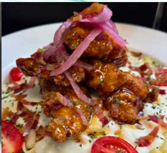
SHANGHAI CHICKEN PASTA