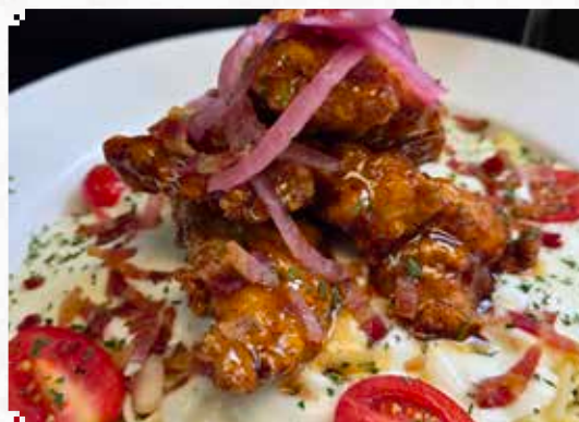
SHANGHAI CHICKEN PASTA