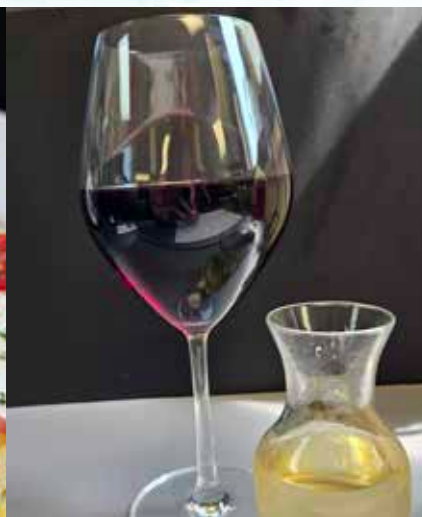
LOCAL PA WINES