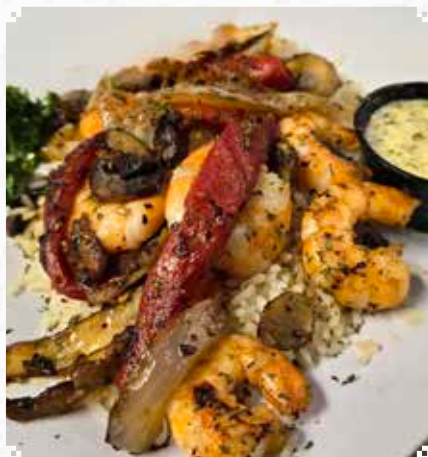
SHRIMP WITH MASON BUTTER