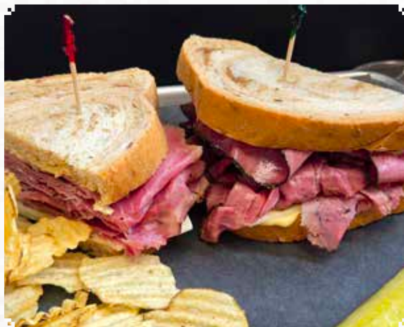
PASTRAMI ON RYE

Texas toast with provolone and mozzarella cheese sauce. Served with sautéed spinach and mushrooms – 12