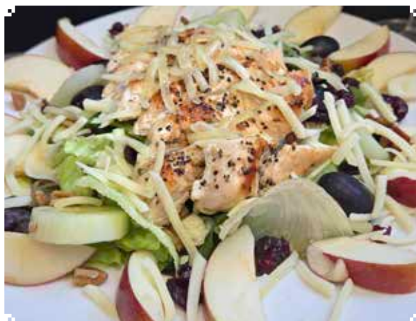
HARVEST CHICKEN SALAD

*PLEASE - No take home on any salad bar or all-you-can-eat items.