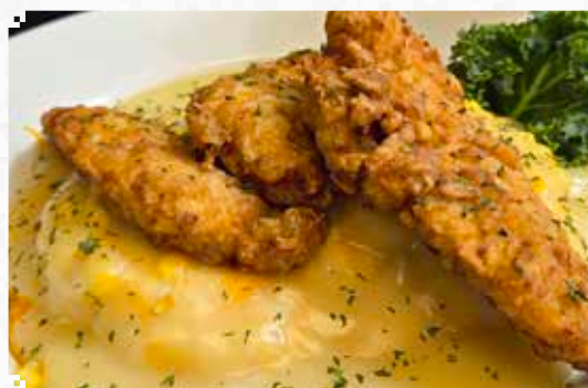
FRIED CHICKEN TENDER BOWL