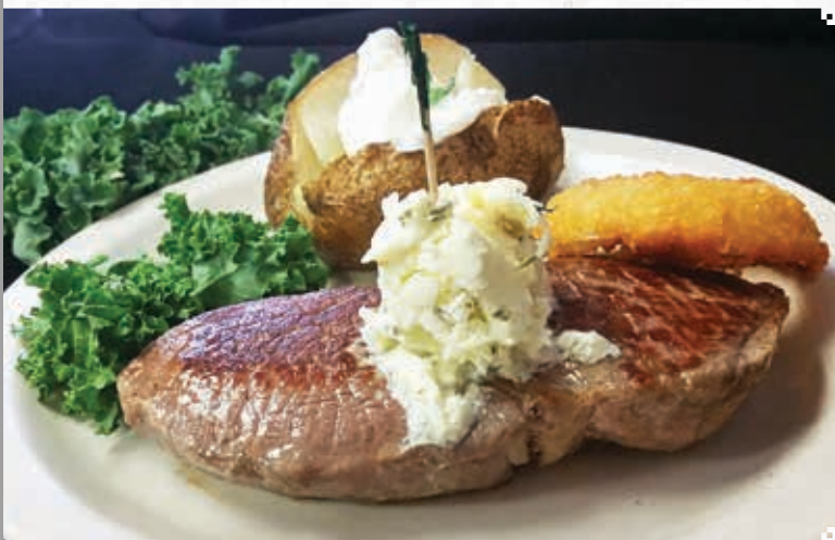
*10 OZ. MASON BUTTER SIRLOIN STEAK

*MAY BE COOKED TO ORDER. PLEASE NOTE THAT CONSUMING RAW OR UNDERCOOKED MEATS OR EGGS MAY INCREASE YOUR RISK OF FOOD-BORNE ILLNESS.